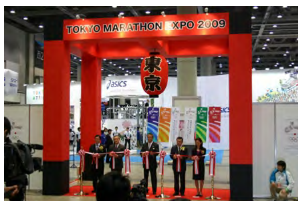
TOKYO MARATHON EXPO 2009